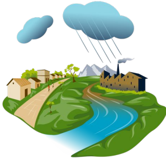
Water Cycle Services